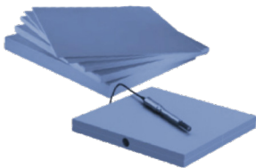
2.0 cm chamber slabs sold separately