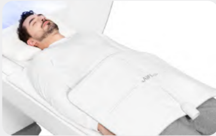
SuperFlex Body - 24