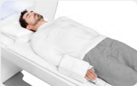
Wrist Coil - 24