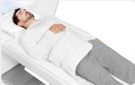
UHD SuperFlex Large - 24