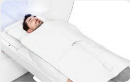
SuperFlex Whole Body - 48