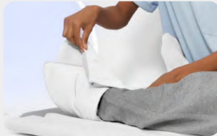
UHD SuperFlex Small - 24