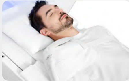
Shoulder Coil - 24